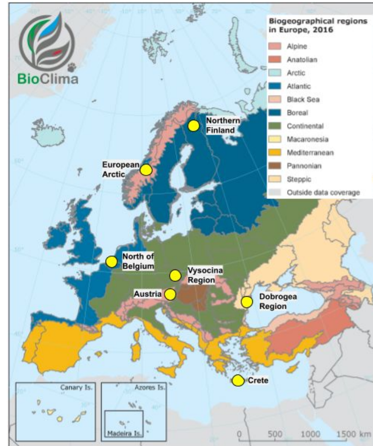
Figure 3. Case study location in relation to biogeographical regions